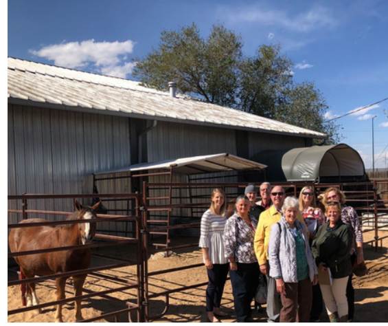
Oct. 2019 - HHRF Board of Directors at Temple Grandin Equestrian Center, Denver, CO